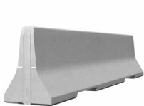
SIMPLEBLOC 80_4 Standard element