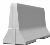
SIMPLEBLOC 100_2 Standard element