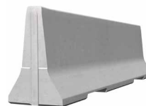
SIMPLEBLOC 100_4 Standard element