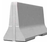
SIMPLEBLOC 100_4 Standard element