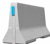
ECOBLOC 100_2 Standard element