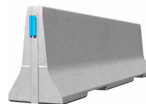
ECOBLOC 100_4 Standard element