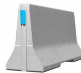
ECOBLOC 100_2 Standard element